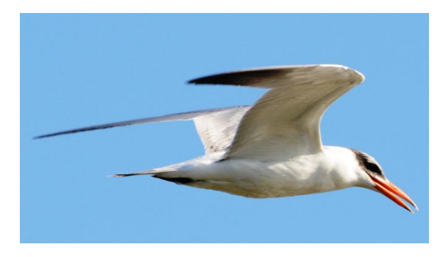
Caspian Tern at La Algaida

proceeded to our next stop, the disused salt pans at