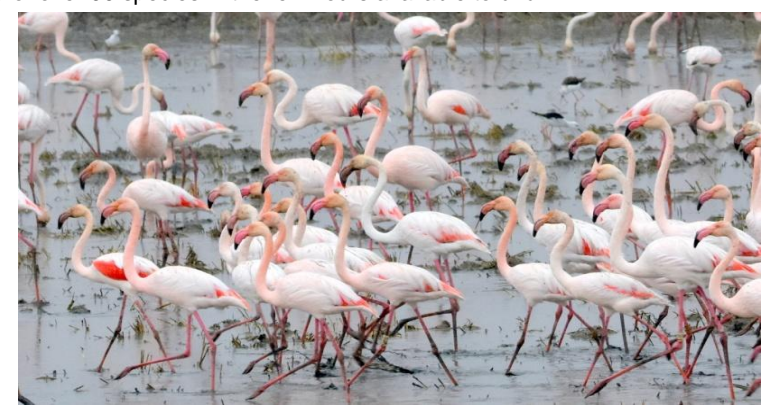
Greater Flamingo at Isla Major rice fields