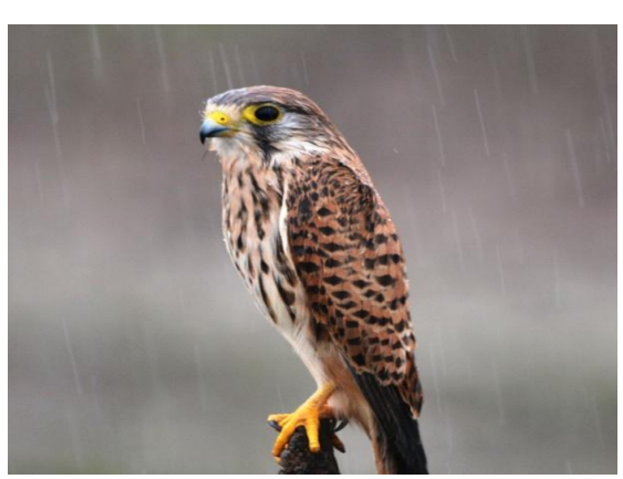
Common Kestrel getting drenched in the rain