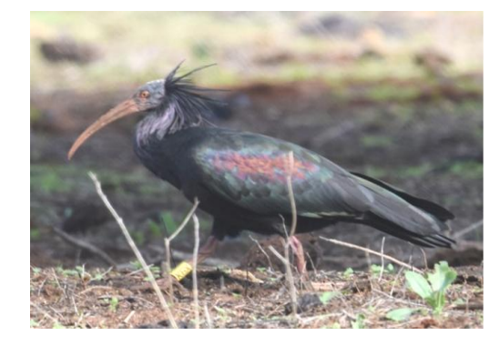
Bald Ibis: Vejer de la Frontera

hopefully Comghal's second 'lifer' of the trip. To see the bird we travelled south to the town of Vejer de la Frontera and began with a search of a golf course in the area where they had been reported to be present a few days earlier. After an extensive search around the area we found three of the birds near a municipal dump, the iconic Bald Ibis. It won't win a beauty contest but the fact it has survived is a testament to all those involved in its recovery programme in Spain. It's looks are not one the general public would warm to but they [birds] can't be all as stunning as the bee-eater family.