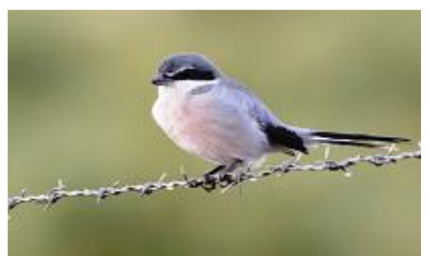
Iberian Grey Shrike

A small pond area produced Coot, Little Grebe, Green Sandpiper, Common Snipe, White Stork, Cattle Egret, Little Egret, Marsh Harrier, Red-legged Partridge, Mallard, Lesser Black-backed Gull, Black-headed Gull, and then we headed for an old Cortijo [in ruins] as the sky began to darken with the rain clouds approaching. Along the way we saw Spanish and House Sparrows, a Dartford Warbler [great spot by Vicent] hiding in some undergrowth; also seen were a flock of Calandra Lark, Stone Curlew, Skylark, Merlin, Kestrel, Sand