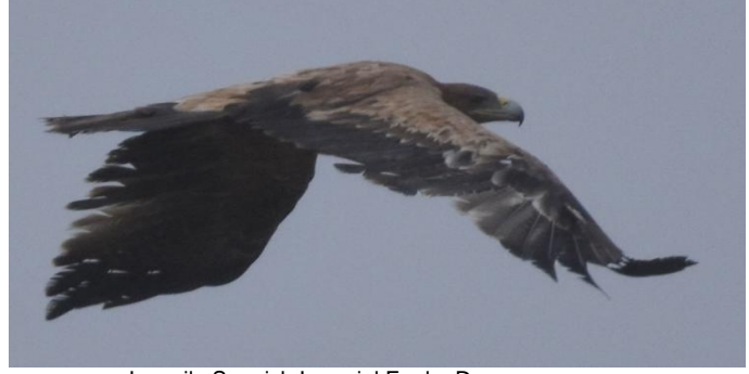
Juvenile Spanish Imperial Eagle: Donana