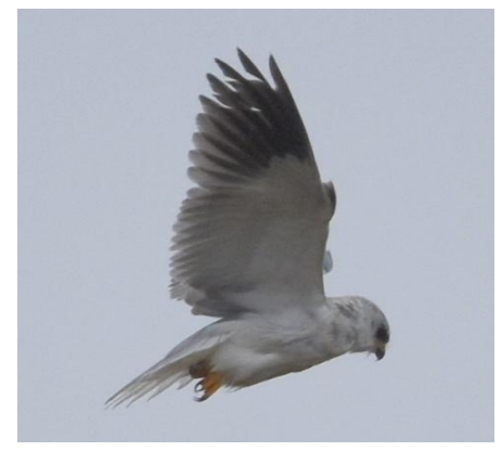
Black-winged Kite in Donana