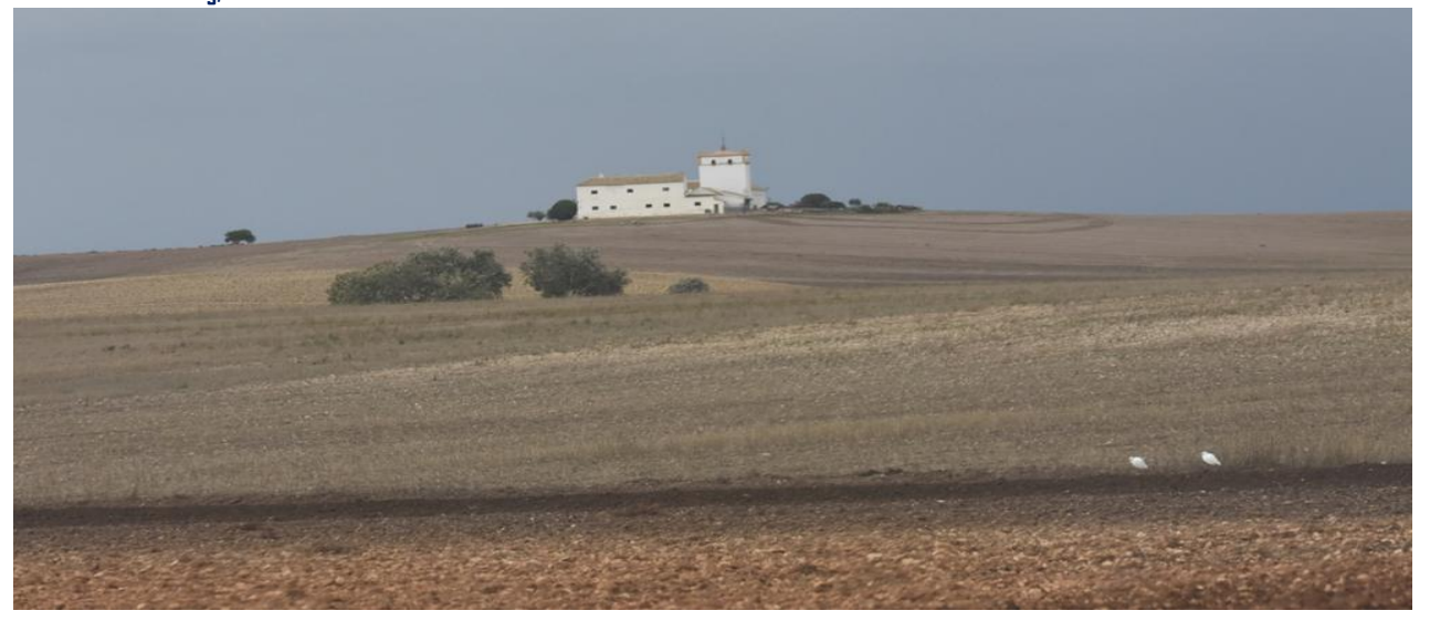
Cortijo at Osuna with a traditional landscape, favoured by the Great Bustards, sadly now being turned into Olive Groves