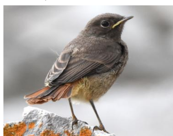
Juv Black Redstart

Walking down the track towards the hotel, the weather started to change again and in the distance we could see some dark clouds coming our way. However we picked up another four species that were very common in the valley before the hotel, Black Redstart , Common Linnet , Northern Wheatear and Water Pipit