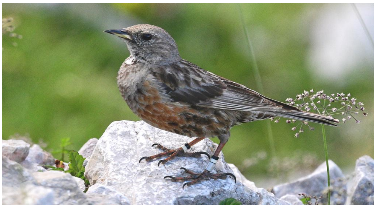
Adult Alpine Accentor

Several parties of hill walkers appeared, having arrived by the first cable car of the day, we waited until they passed and eventually we got within a few metres of the bird. The second lifer of the trip for Comghal and I following the Snowfinch