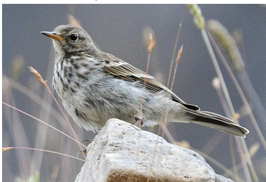
Juvenile Water Pipit