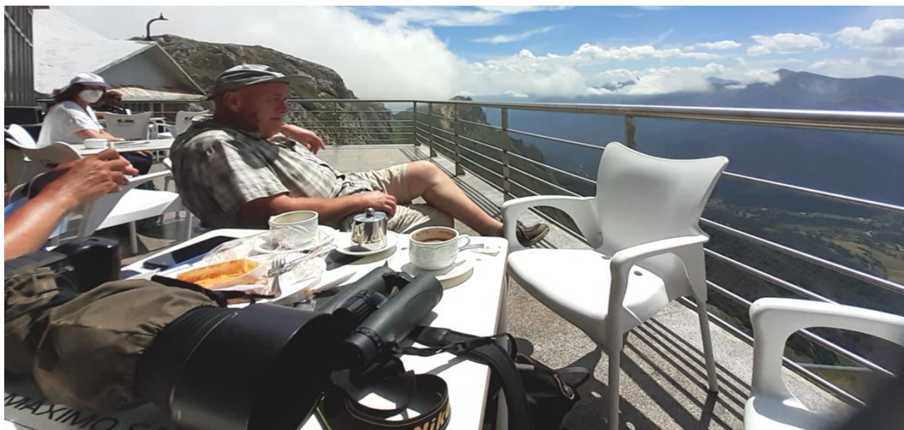
Having coffee on the café terrace at the cable car terminus