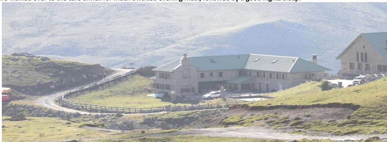
Hotel Aliva: 1700m altitude Picos de Europa, where we stayed for two nights

We arrived at the Hotel just as the rain started, tired but happy with a superb days birding behind us. A quick shower and we walked over to the café annex for much awaited evening meal, followed by a good nights sleep.