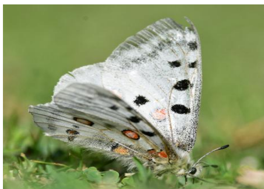
Apollo Parnassius Apollo

A relevant topic of the moment, social distancing doesn't seem to be a problem for Alpine Choughs; some birds would almost sit at your feet waiting for some morsel or other to eat. Whilst watching the birds several butterflies were noted as they passed up and down the valley: notably the Apollo, a