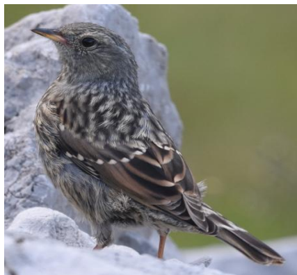
Juv Alpine Accentor

It was getting on so after another successful day, we headed back on the 5km walk back to the hotel, stopping several times to re-acquaint ourselves with birds we had seen earlier, concentrating on taking some photos.