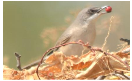
Western Orphean Warbler

3 Paracuellos de Jarama: to get there you take Line 5 to Cannilljas Metro Station and from there is a five minute walk to Canillejas Square. Here you take the <u>ALSA 211 bus</u> which takes you under the airport runway and after leaving the tunnel you take the second stop at an industrial estate [ poligono]. Either side of the road will take you down to the pathway along the river. This path goes for miles and is used by the local dog walkers. The habitat along the river is lush and the birds not easy to see, but with a bit of effort and time, at least three hours in my case, it was well worth it. Like all the sites , the best time to visit in August is between 08:00 to 11:00, after that the temperature is up around 30C and terrestial birding virtually stops, ofcourse the vultures and raptors start to appear then in the thermals. Birds seen were Western Orphean Warblers, Garden Warblers, Willow Warblers, Bonelli's Warblers, Chiffchaff, Redrumped Swallows, Woodchat Shrikes, Golden Orioles, Water Pipits, Green Sandpipers, Melodious Warblers, Blackcaps, Serins, Spanish Sparrows to name a few. Overhead were 100's of Black Kites on migration. Kestrels, Booted Eagles, Black and Griffon Vultures were also showing well.