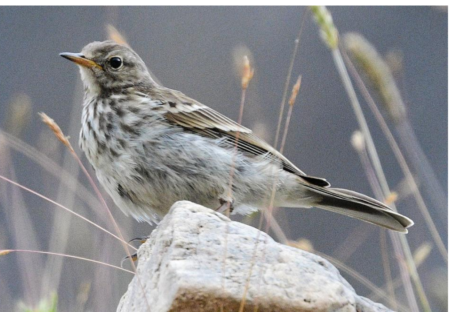
Juvenile Water Pipit