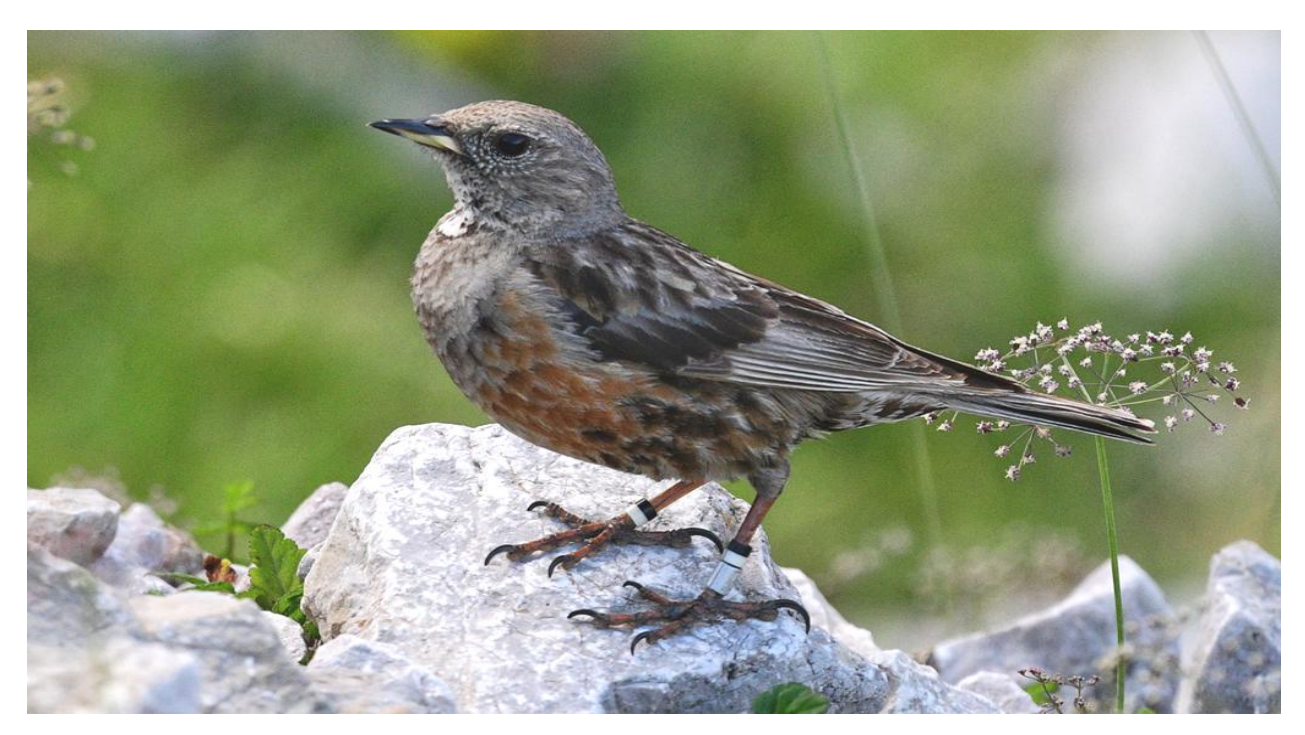
Adult Alpine Accentor

Several parties of hill walkers appeared, having arrived by the first cable car of the day, we waited until they passed and eventually we got within a few metres of the bird. The second lifer of the trip for Comghal and I following the Snowfinch