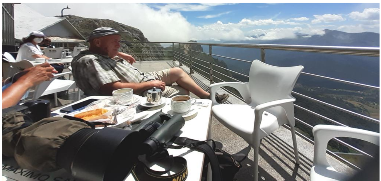
Having coffee on the café terrace at the cable car terminus