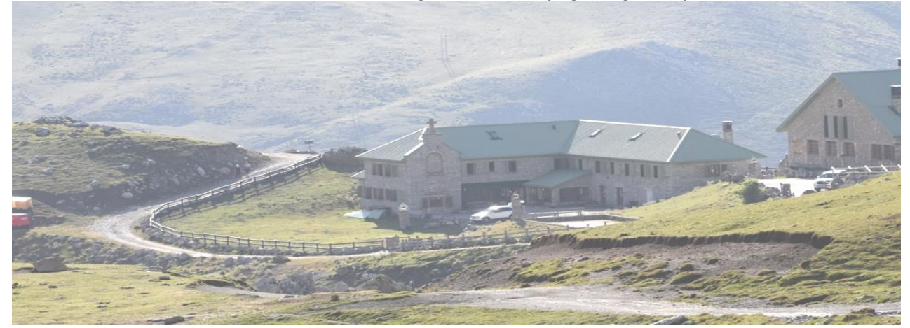
Hotel Aliva: 1700m altitude Picos de Europa, where we stayed for two nights

We arrived at the Hotel just as the rain started, tired but happy with a superb days birding behind us. A quick shower and we walked over to the café annex for much awaited evening meal, followed by a good nights sleep.