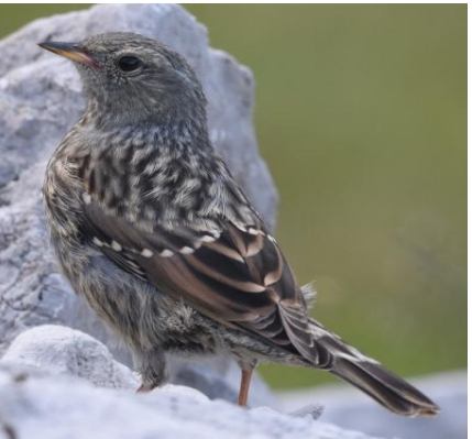
Juv Alpine Accentor

were rewarded after waiting an hour, with some excellent views of this iconic bird.