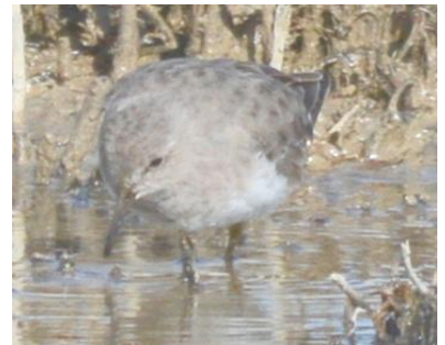
Stint, Temminck's Calidris temminckii