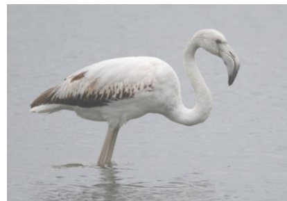
Flamingo, Greater Phoenicopterus ruber