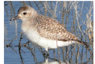
Plover, Grey Pluvialis squatarola