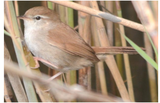
Warbler, Cetti's Cettia cetti

All in all Comghal and I had a fantastic weeks birding, despite the weather, with 93 species seen during the week.