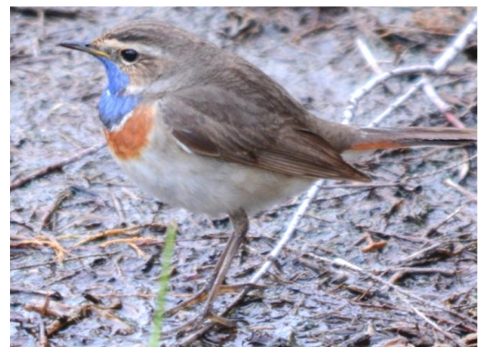
Bluethroat Luscinia cyanecula Highlight of the trip with one very confiding bird found on the