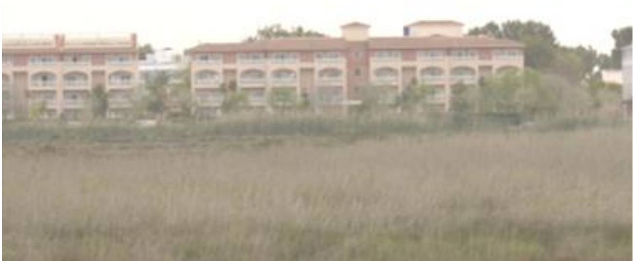
Viva Blue Hotel; Playa de Moro: overlooking the S'Albufera