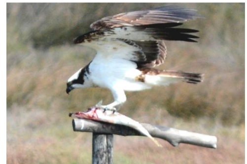
Osprey Pandion haliaetus