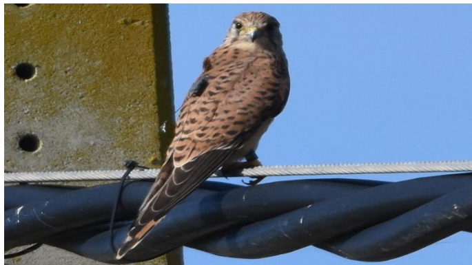
Lesser Kestrel with satellite tag

Montagu's Harrier, Red Kite, Black Kite, Booted Eagle and Black-winged Kite all showing well. Our next stop was a set of disused buildings that were the home for a colony of Lesser Kestrels and we saw at least 30 birds in the area. A number of birds had what looked like satellite wing tags on them as you can see from the picture opposite. Also noted nearby were several Northern Wheatear , Stonechat , Lesser Short-toed Larks , Skylarks , Hoopoe , and up in the sky, a tussle between several Marsh Harriers and an immature Spanish Imperial Eagle . You would think it couldn't get any better than this sequence of great birding; well Donana never fails to surprise the visitor. As we were driving along the main road between the reserve and some rice paddies, we witnessed an almost vertical assault from above of