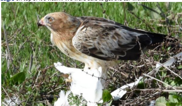
Booted Eagle with Little Egret kill

a Booted Eagle on a Little Egret . We halted the car as soon as safety allowed and went back to the spot where we had seen the attack happening and sure enough there was the Booted Eagle on top of it's victim. We were able to get the car within 10m of the incident and watched for a few minutes as the eagle subdued its prey. It wasn't long before the local Ravens turned up to muscle in on the food. The Common Magpie didn't miss the event either and soon appeared as well, for any possible 'extras'. The day was getting on and I wanted to see their cousins [a-w magpie] at another location, which was supposed to be a good area to see them as they were used to people. After 15 minutes of hard driving i.e. not stopping if a suspect bird is seen, we reached the site and within minutes we saw the first of at least 50 birds. The Azure-winged Magpie , a handsome bird and easy to photograph for once. Also found at this location was a single Sanderling , Eurasian Spoonbill , Spotless Starling , Iberian Shrike and Grey Plover .