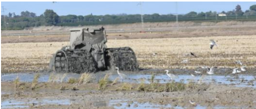
Tractor churning up rice paddy

As we approached the reserve from Isla Major, we came upon our first rice paddies that were being 'churned up' as we