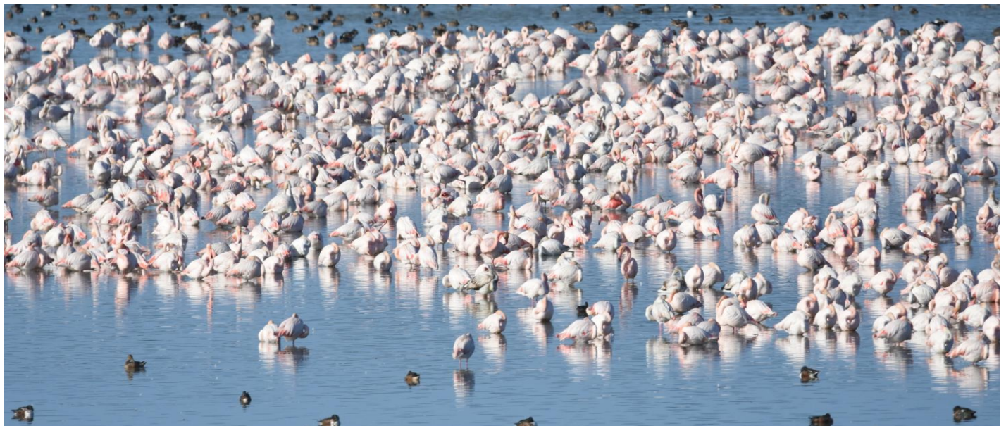
Greater Flamingos at Dehesa de Abaho

Dehesa de Abaho Visitor Centre , for a welcome cup of coffee in the café. We then walked down to the laguna which forms the heart of the centre. In the sunshine the brilliant pinks of the Greater Flamingos were the highlight of the Laguna.