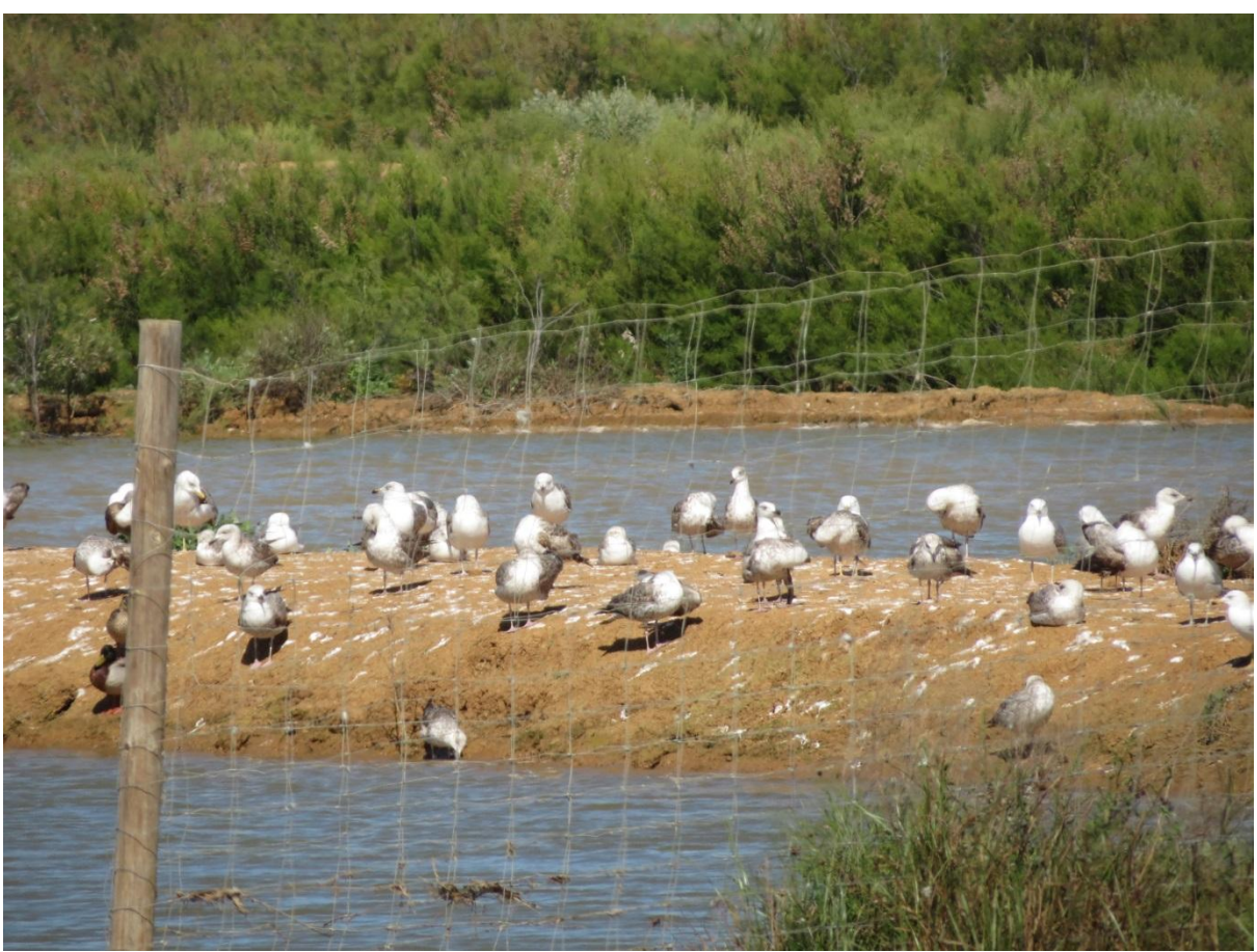
Some of the hundreds of gulls at the Lagoa. Most were yellow-legged but there were other species among them.