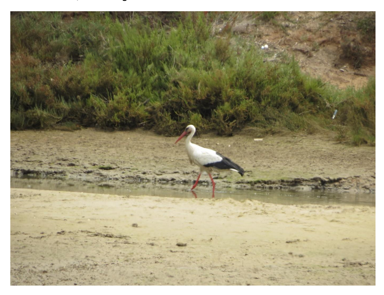
White stork at Quinta do Lago to give an idea of the tidal habitat

On 24<sup>th</sup> we drove up to Serra de Monchique , a serra being a range of hills. We didn't see much in the town (White Wagtail) but decided to drive higher up the hill towards Fóia, at 950m the highest point in the Algarve. We stopped before the summit at a little lay-by and explored on foot. The vegetation was very scrubby. It was one of those places where you could hear more birds than you could see. The only definite sightings were