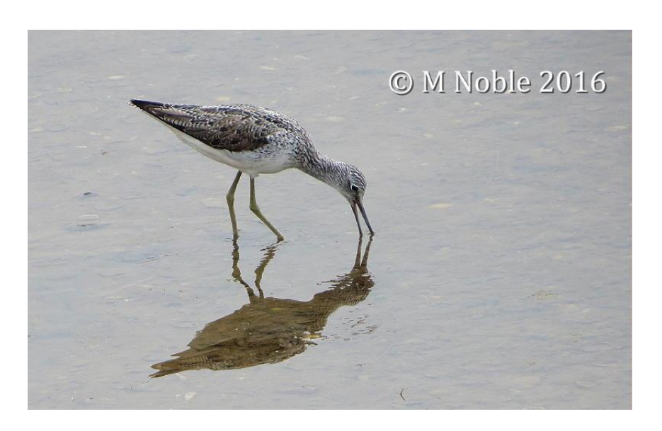
Greenshank at Quinta do Lago