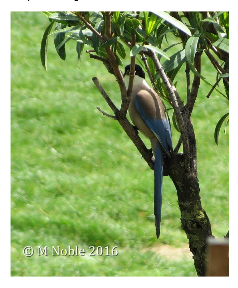
Iberian magpie on the golf course