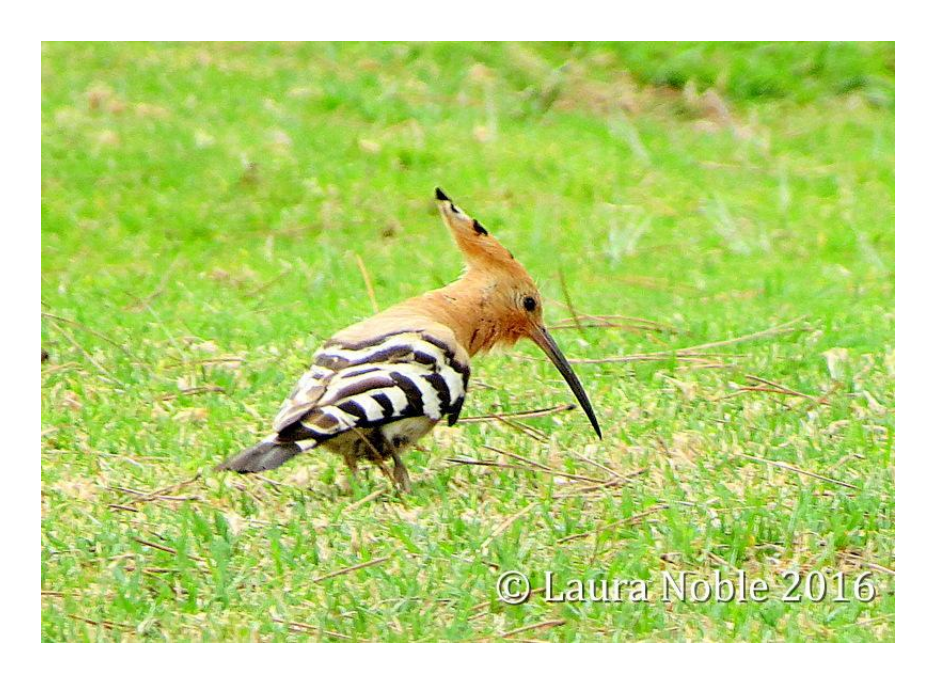
Hoopoe on the golf course