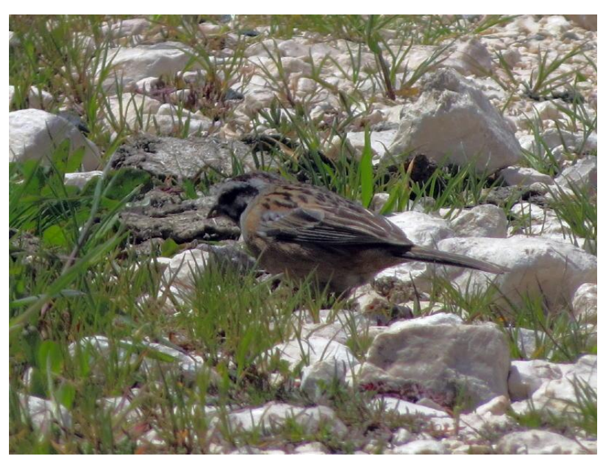
Rock bunting at Fóia

Rock Bunting, Nightingale and Stonechat though I'm pretty sure that a raptor that flashed past was a Sparrowhawk . I could see two distant raptors which looked like buzzards.