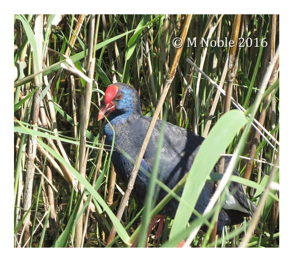
That was pretty much it, bird-wise. But I'll finish with a couple of shots taken at the hotel – and a list of birds seen.