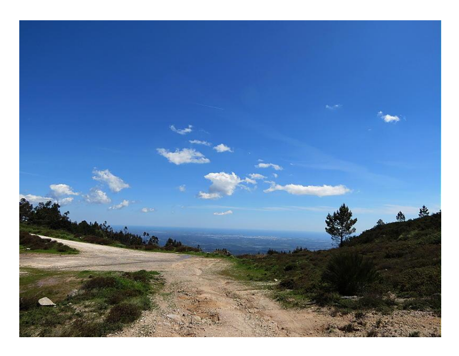
Rock bunting habitat at Fóia. This is the view to the West and the sea could be seen in the distance. This point is probably about 850m above sea-level.

The next day we visited the historic capital of the Algarve, Silves . There were lots of swifts but I'm afraid I never managed to figure out which! The same applied to a Kestrel although it must surely have been Common. The main highlight here was lovely views of nesting White Stork from the castle battlements.