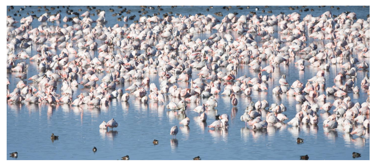
Greater Flamingos at Dehesa de Abaho

We then headed into the reserve proper and our first stop was at the Dehesa de Abaho Visitor Centre , for a welcome cup of coffee in the café. We then walked down to the laguna which forms the heart of the centre. In the sunshine the brilliant pinks of the Greater Flamingus were the highlight of the Laguna.