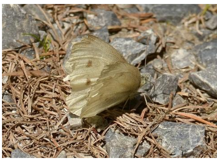
Mountain Small White