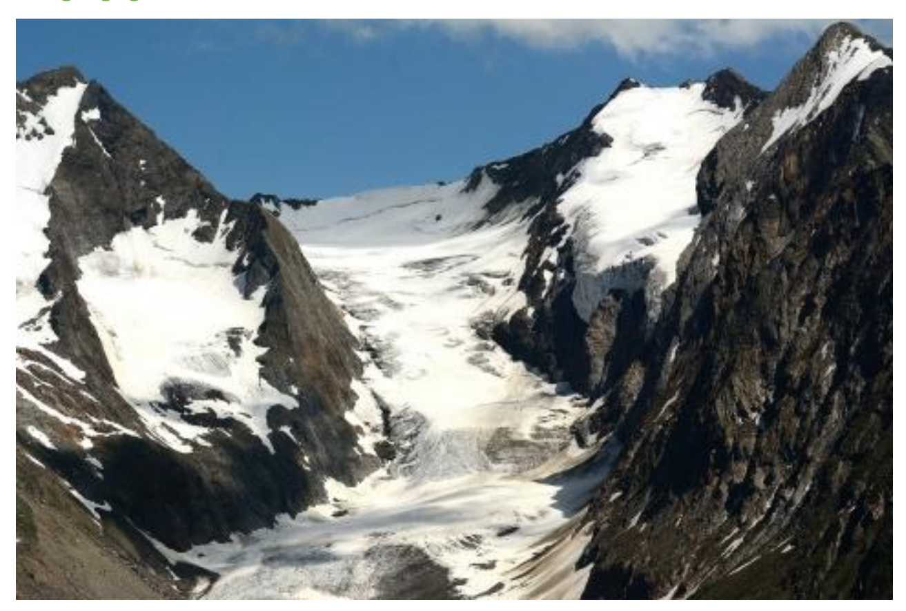
View of Glaciers from top of Obergurgl gondola

This area was the most productive in terms of birds, on the top plateau within thirty minutes we had a nice Snowfinch (lifer) come fairly close whilst we were having a break. This pattern of birds coming to us whilst we were seated was repeated several times.