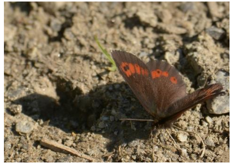
Large Ringlet Blind Ringlet