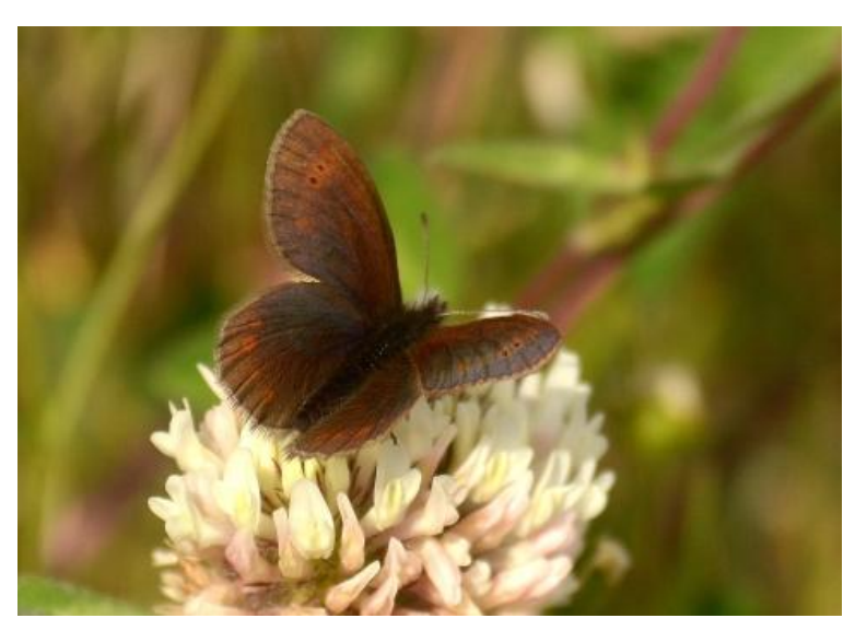
Lesser Mountain Ringlet