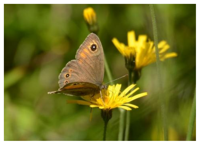
Large Wall Brown