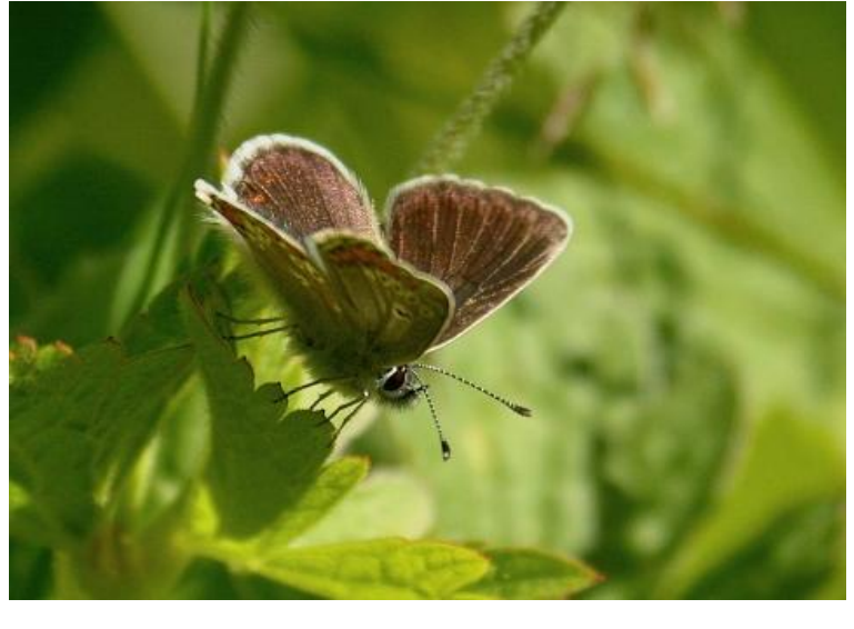
Chalkhill Blue Escher's Blue