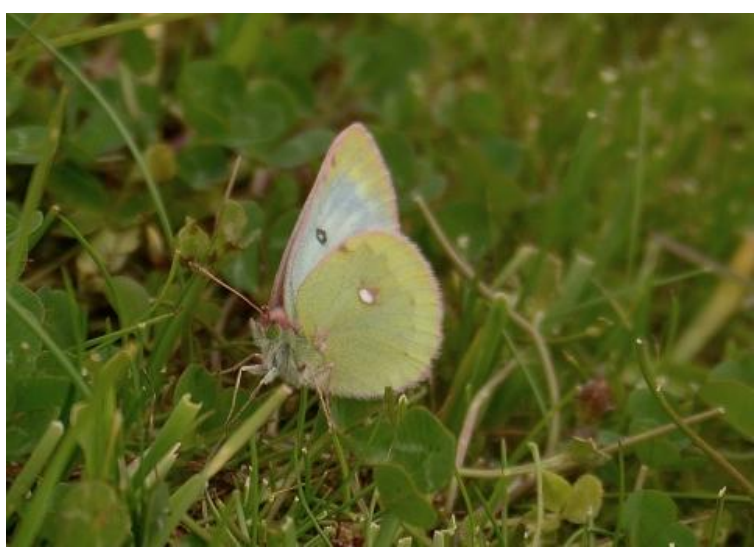
Mountain Clouded Yellow