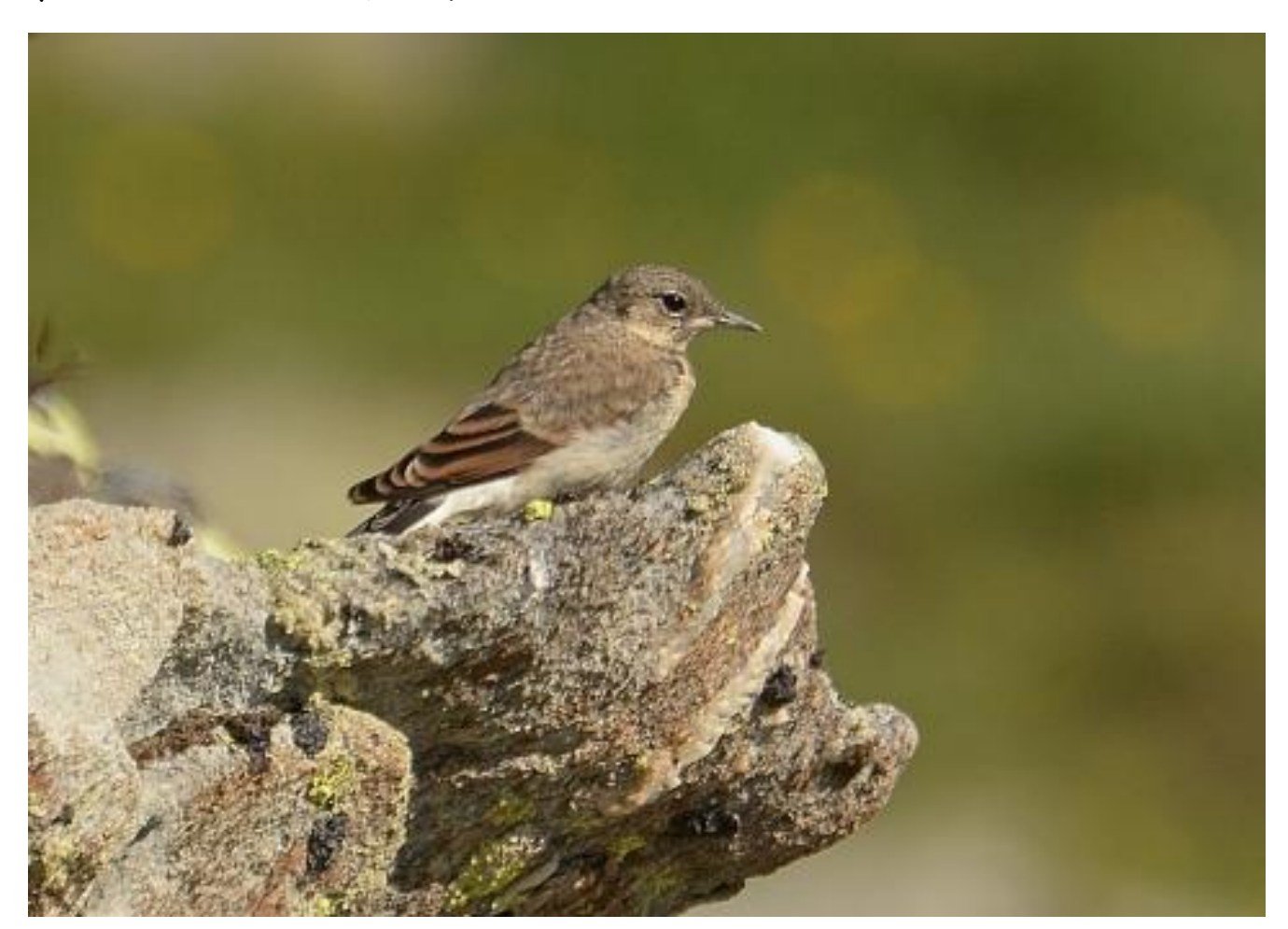
Juvenile Northern Wheatear

At least one pair of Northern Wheatears was nesting here and a pair of displaying Ravens flew close over our heads.