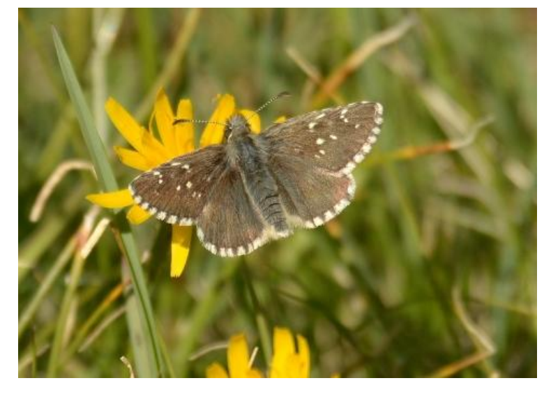
Dusky Grizzled Skipper