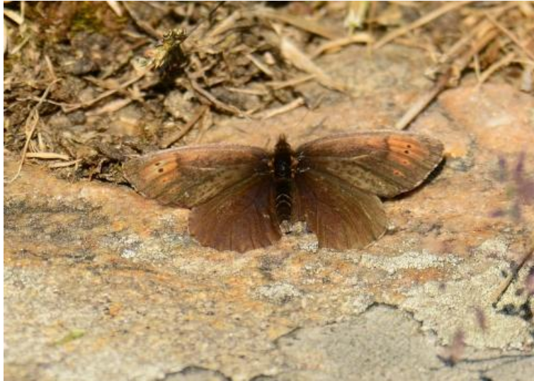
Dewy Ringlet Mountain Ringlet