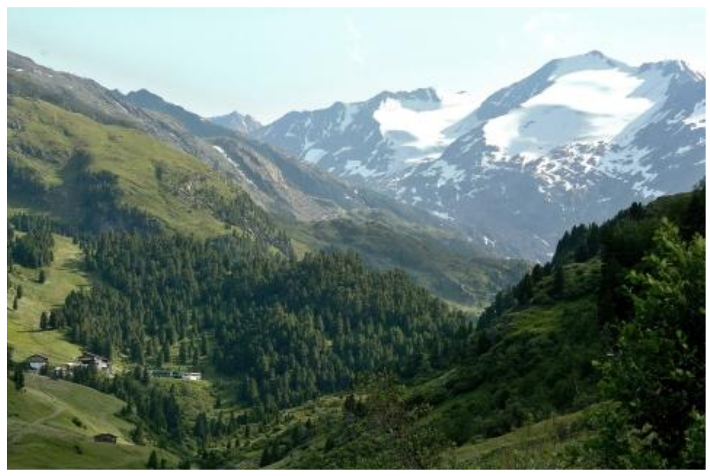
The Obergurgl Valley