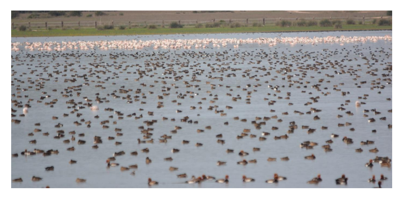
Part of the huge wildfowl flock in Dehesa de Abajo

In the Dehesa de Abajo visitor centre the adjoining reservoir is a refuge for thousands of waterfowl, especially when autumn and winter are very dry and Donana and its surroundings have little water.