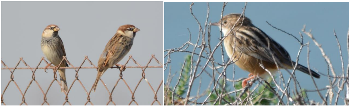
Male Spanish Sparrows

The highlights of the walk along the riverbanks were: Wryneck, Woodlark, Lesser Spotted Woodpecker, Spoonbill, Black-winged Kite, Booted Eagle [pale form], Green Woodpecker, Common Waxbill, Azure-winged Magpie, Red Kite, Willow Warbler, Chiffchaff, Zitting Cisticola, Cetti's Warbler and of course all the usual suspects that you would find in this type of habitat.