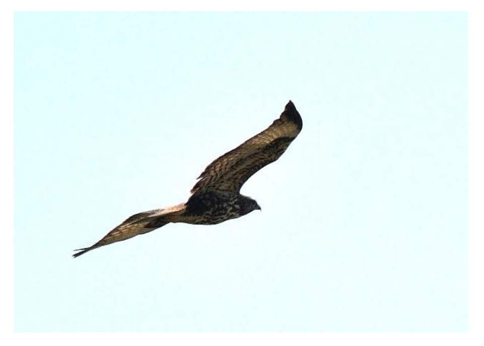
Honey Buzzard (probable)