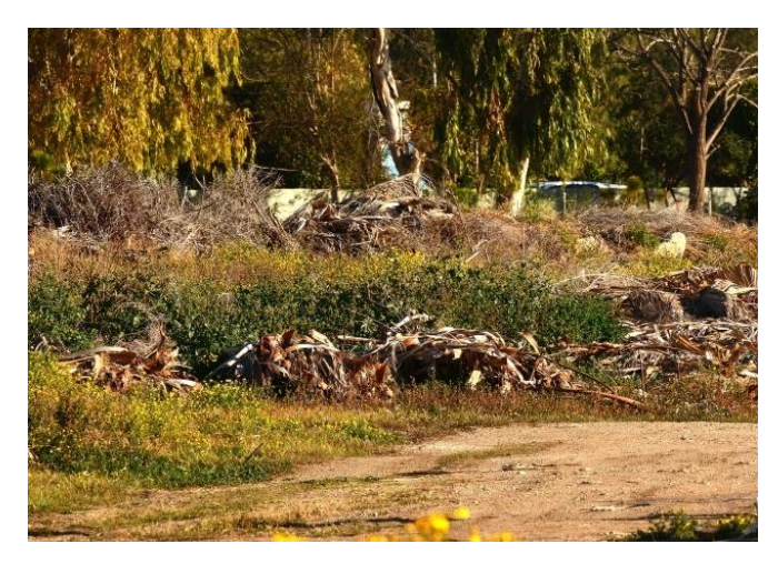
Hotel Green Waste