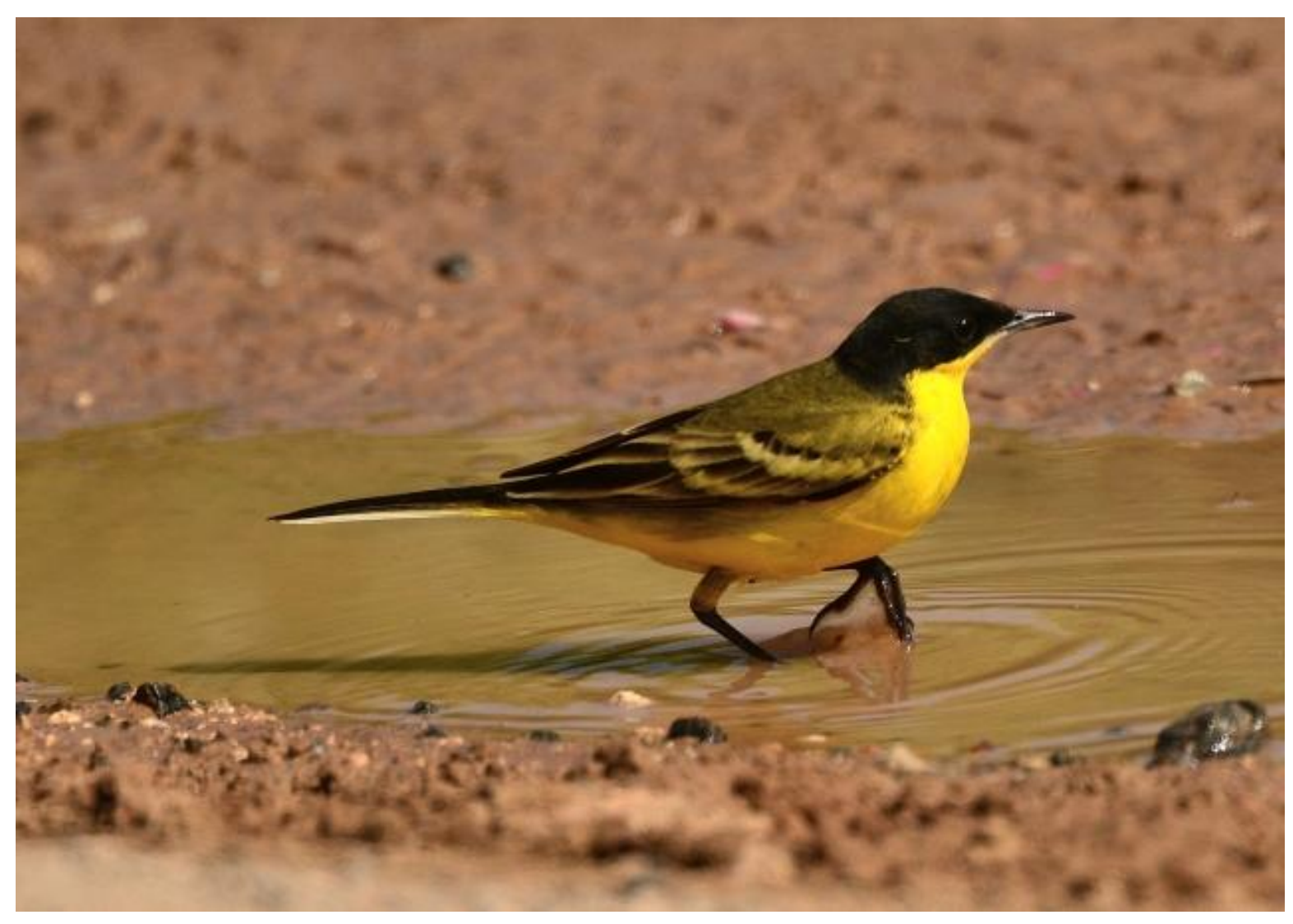
Yellow Wagtail (feldegg)

For directions see 2015 report. Twenty Night Heron were seen migrating and a group of ten Yellow Wagtail bathed in a rare puddle whilst we sat perhaps 5m away, also seen on this walk were many Chiffchaff and a Black Francolin.