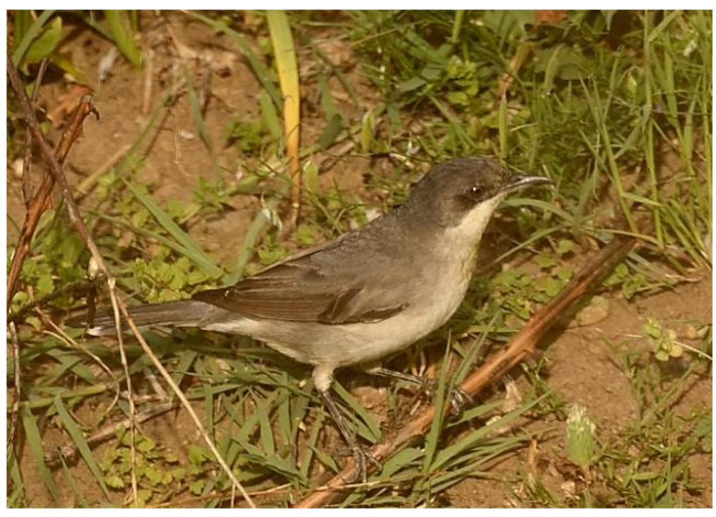
Eastern Orphean Warbler (lifer)