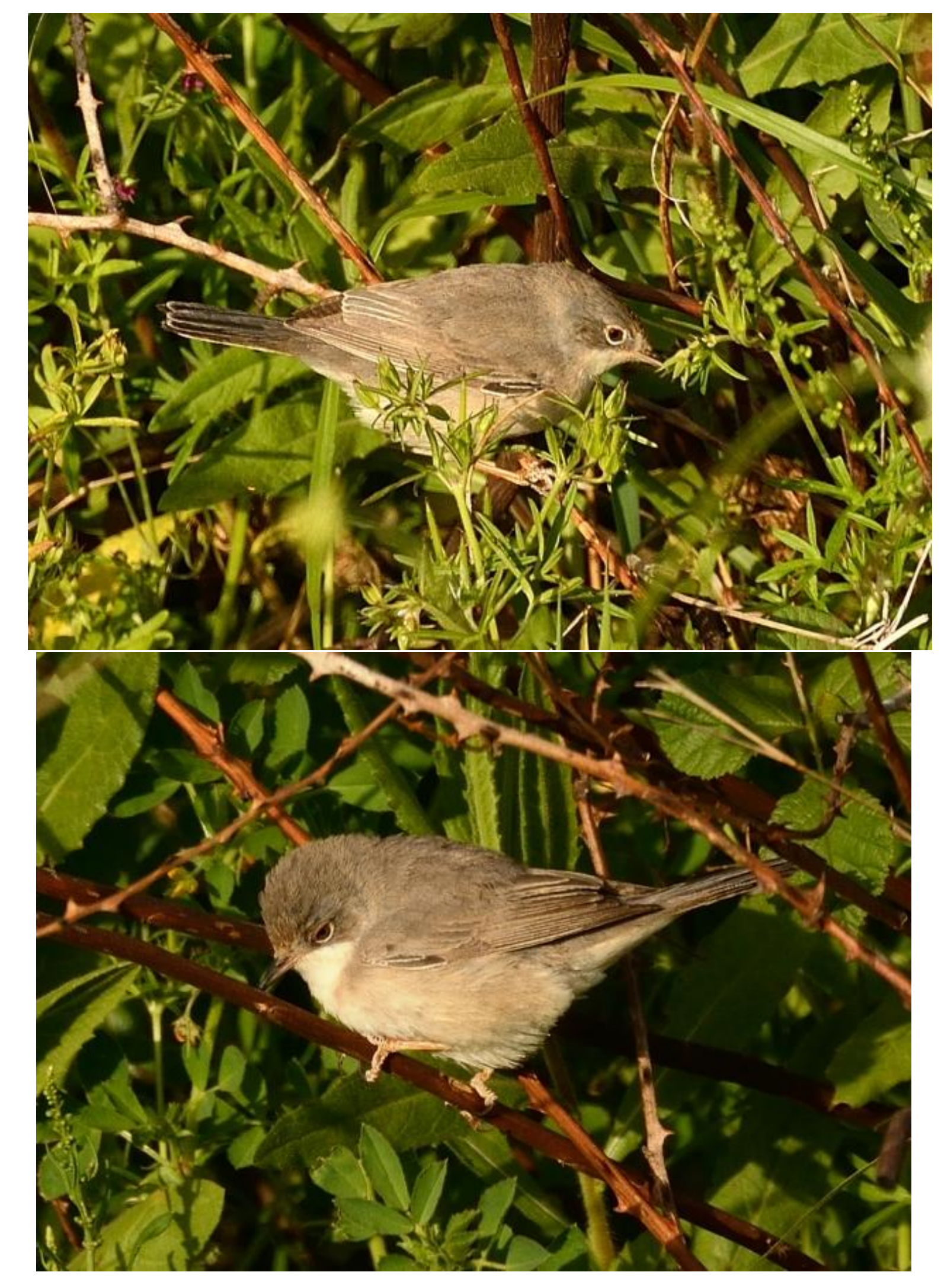
Eastern Subalpine Warbler