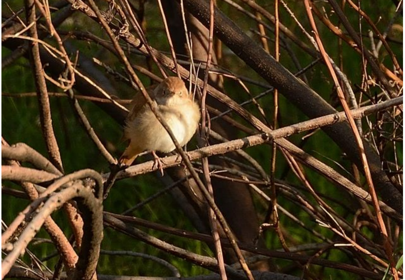
Asian Desert Warbler (lifer)

(14 previous Cyprus records, last seen 2011)