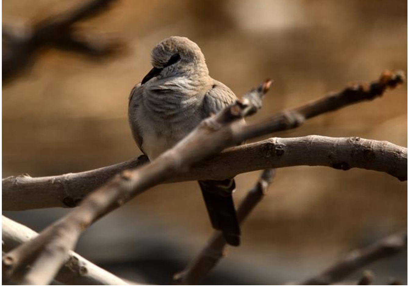
Namaqua Dove (four previous Cyprus records)