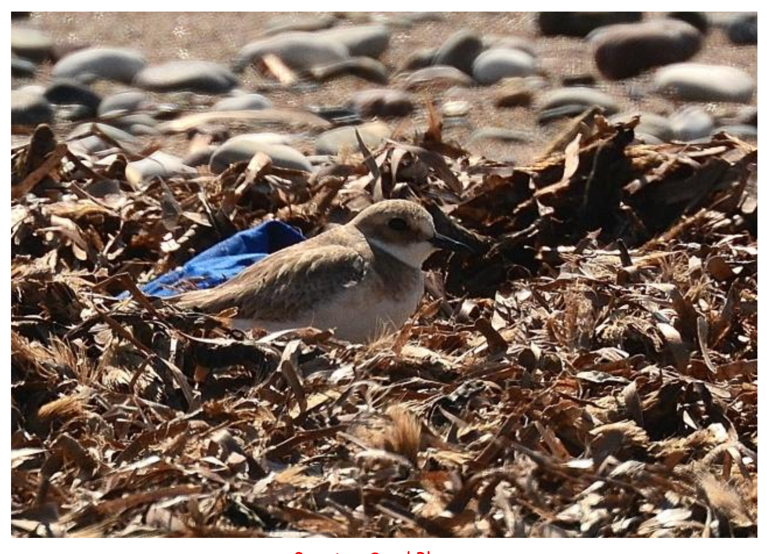
Greater Sand Plover