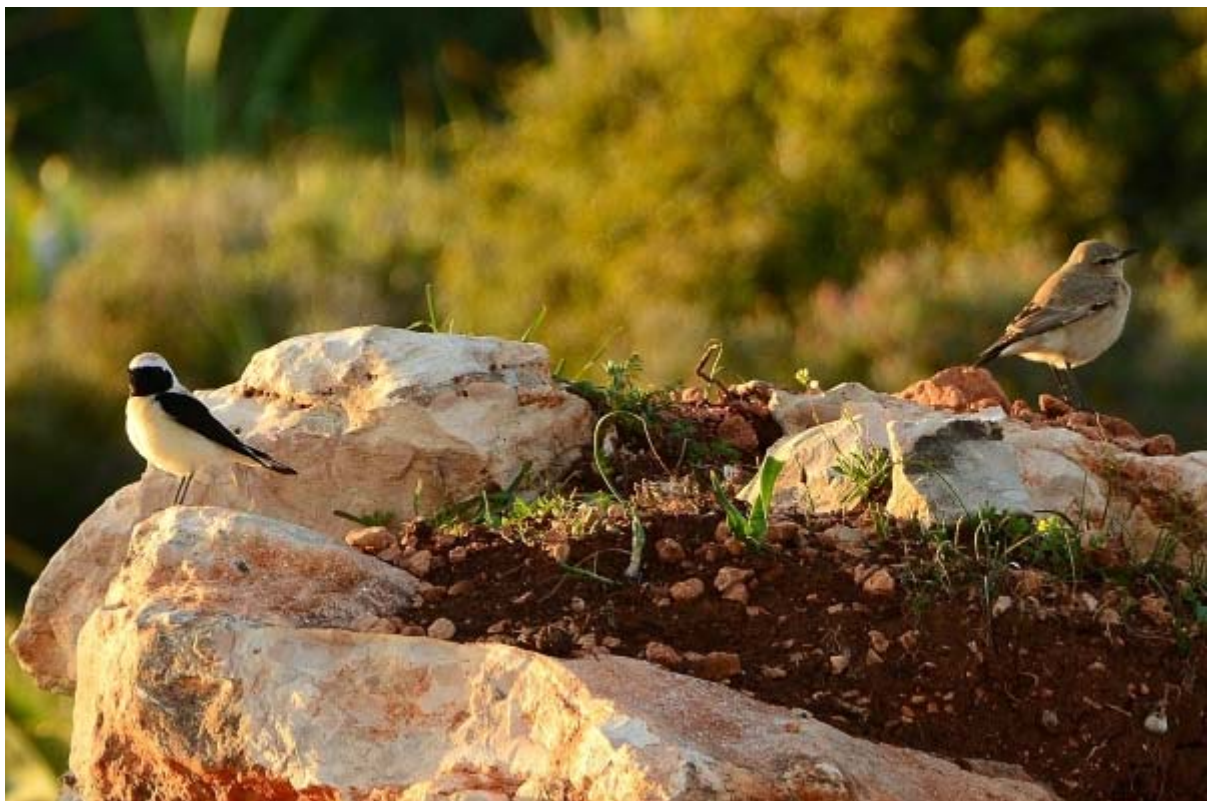
Black-eared and Isabelline Wheatears