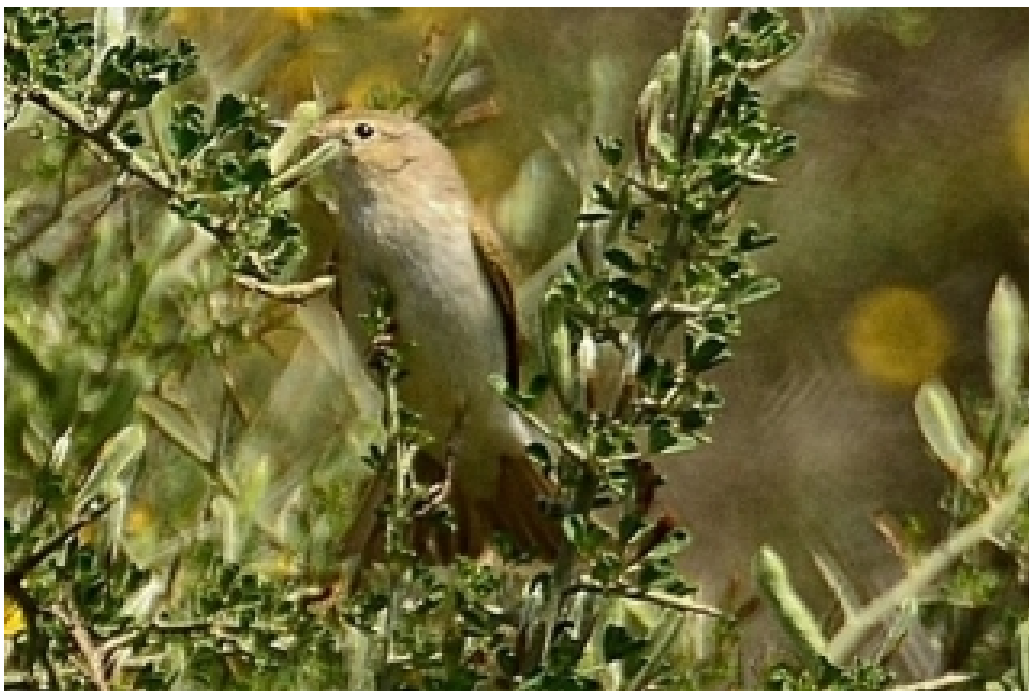
Eastern Bonelli's Warbler

This bird initially flew over our heads at medium height over the hill into the next valley, it then started to soar to a great height until it was only visible through binoculars, we were then astonished to see it close its wings and drop at fantastic speed to the ground. I have seen Peregrines do this and this seemed at least as fast, it then came over our valley where I took this shot.