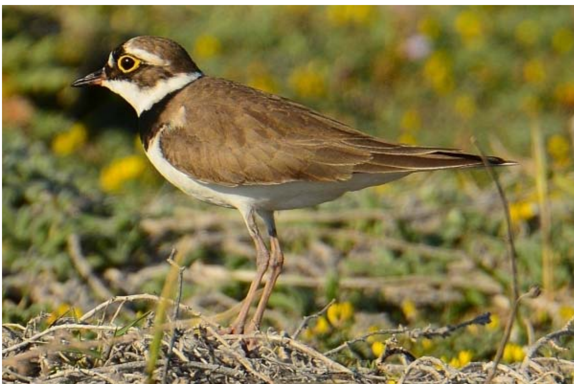
Little Ringed Plover

Birds seen here were two Little Ringed Plover , six Meadow Pipit , twenty Spanish Sparrow and three Northern Wheatear .