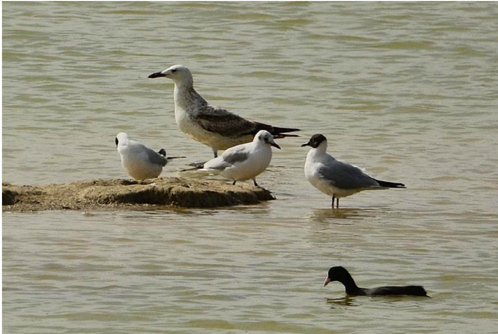
Caspian Gull with Black Headed

Seen here were three Cattle Egret , thirty Flamingo , four Spur Winged Plover , two Mallard , ten Coot , four Little Grebe , three Red-crested Pochard , fifty Black Headed Gull , one Caspian Gull (lifer), six Shoveler and two Teal .