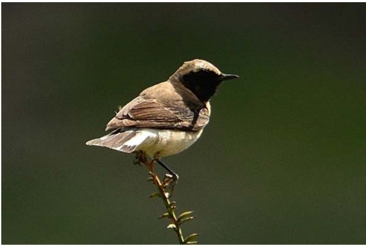
Eastern Black-eared Wheatear

This site was very good for butterflies with many Swallowtail , Orange Tip , Blues , Large Wall Browns and a few Eastern Festoons which was a first for us.